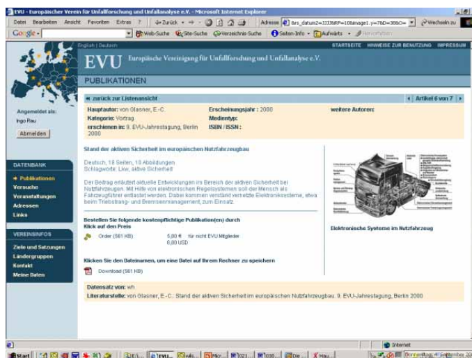
Fig: Article to Download at www.EVUonline.org

All information, including downloadable documents such as PDF, Excel, Word and photos are stored in an Access database. Comprehensive search and research possibilities with search templates and filters have been set up for the user. These make it possible to find the desired information via keywords, authors or other search criteria. The Knowledge Base is fed with data by the members themselves. Texts, photographs and even complete documents can be entered into an easy-to-operate template structure and be put onto the server with a mouse click without the need for any programming skills. Editorial rights are however required for this, which only a few of the members possess. This ensures that no unchecked information is published there. Every member can however send material to one of the editors, who will then publish it immediately.