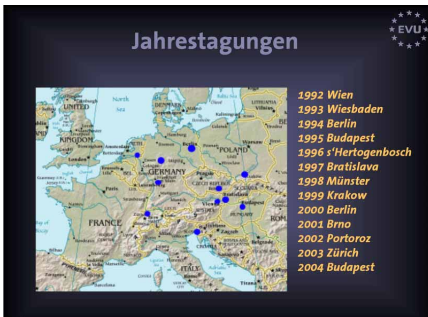
Fig. Annual Conference of the EVU

The EVU with its headquarters in Hamburg as an umbrella association organises an ordinary members' meeting every year. This always takes place in the framework of the EVU annual conference in alternate countries. Furthermore, it convenes specialist committees and attends to their work and critically examines and possibly further recommends events for education and training. The umbrella association is also responsible for publicity work for the EVU and for the authorisation of the country groups' rules.